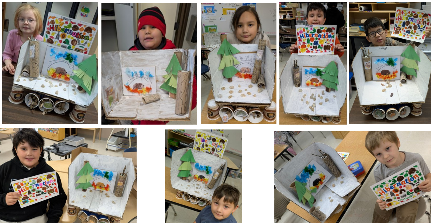
Our first months of school were a lot of fun using our imaginations to be creative and explore new things with our friends!